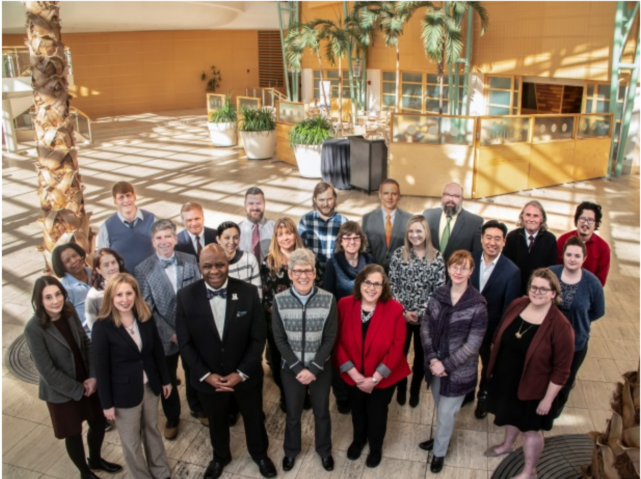
MVRPC Staff Photo – February 25, 2019